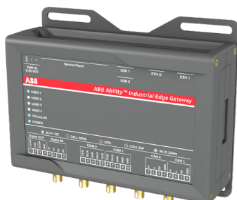
ABB switchgears can also be equipped with Edge Industrial Gateway. Please refer to your ABB contact person for further information.

In order to unlock the web-server functions of ABB Ability Energy Manager, it is required to purchase yearly recurring or perpetual one shot voucher licenses in ABB Ability Marketplace™.