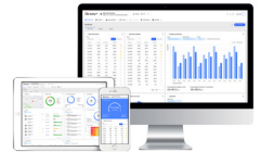
Abb Ability™ Energy and Asset Manager